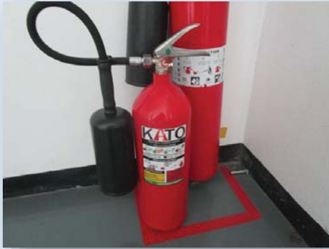
- FIRE EXTINGUISHER (CO 2 PORTABLE ) Total 5 Cylinders