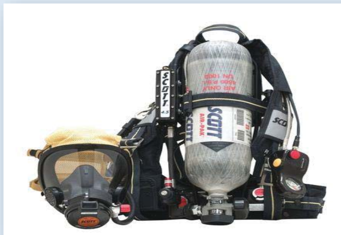
-SCBA Total 4 Sets