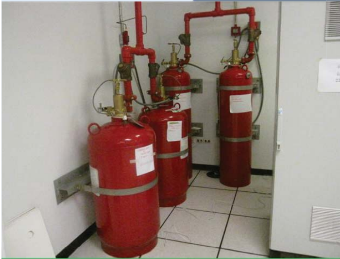
NOVEC 1230 System